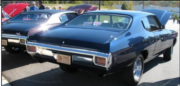
Hot Rods at the Race Shop - Carshow at Stewart-Haas Racing