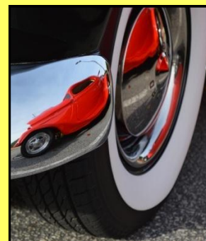
taken at Grill 57 Reunion Cruise - Nov 2012