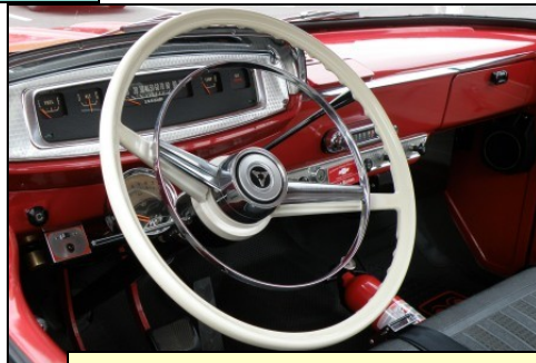
1966 Dodge D100 Dash—Joe Barnes