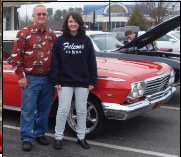
New Year's Day Grill 57 Cruise-In