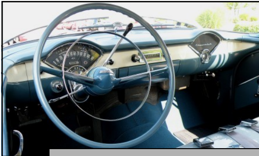
1955 Chevy 210 Dash—Lee Caplan