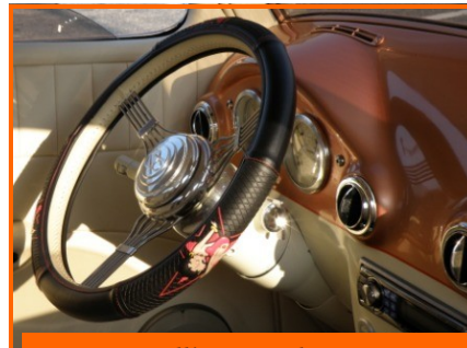
Sammy Small's 36 Dodge Coupe Dash