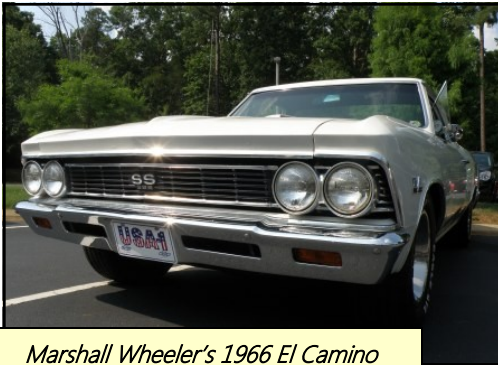
Marshall Wheeler's 1966 El Camino