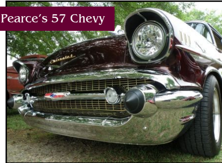
Charles Pearce's 57 Chevy