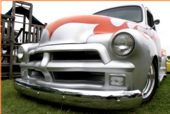
Sammy & Aline Small's 1954 Chevy Pickup Streetrod