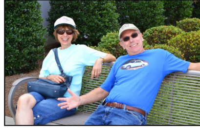
PCCC Members at the 9th Annual Carolina Chevelle Association Carshow at Hendrick Motor Sports.