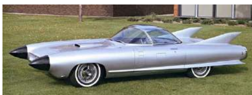
1959 Cadillac Cyclone