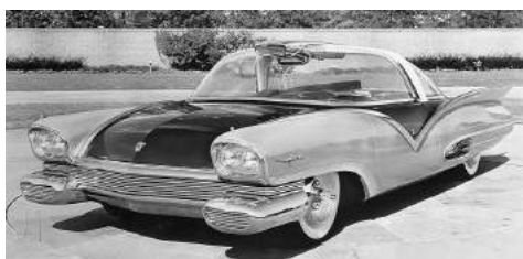
1955 Ford Mystere