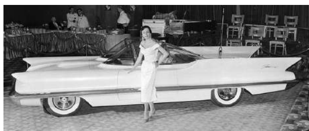
1954 Lincoln Futura