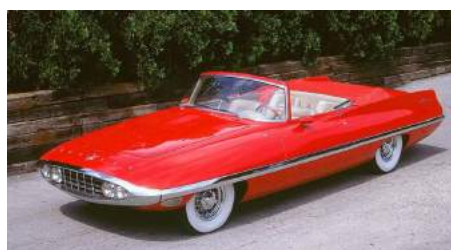
1956–1957 Chrysler Dart/Diablo