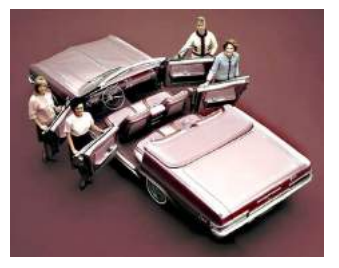
1966 Chevrolet Caribe