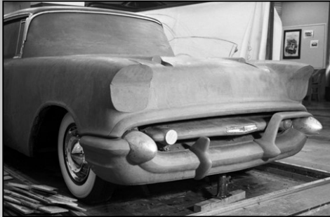
1955 Clay Model (Future 1957 Chevrolet)