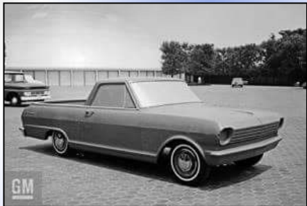
Early 1960's Nova El Camino