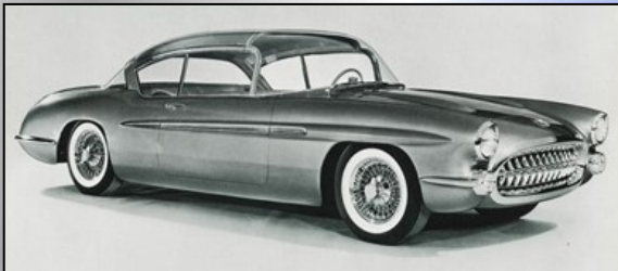
1956 Chevrolet Impala Concept