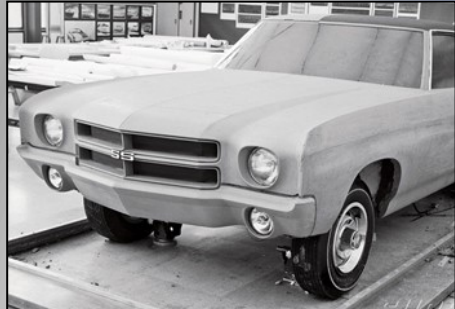
1970 Chevelle Prototype