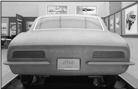
1964 Prototype Panther (Future Camaro)