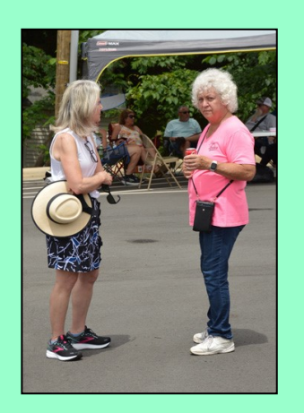
The Day at the 2023 Made In The U.S.A Carshow