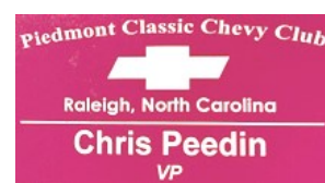
Pink Ladies Name Badge