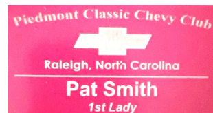
Pink Ladies Name Badge