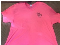
Pink Ladies V-Neck