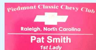
Pink Ladies Name Badge