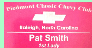
Pink Ladies Name Badge