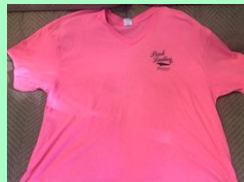
Pink Ladies V-Neck