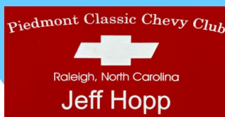
Standard Name Badge