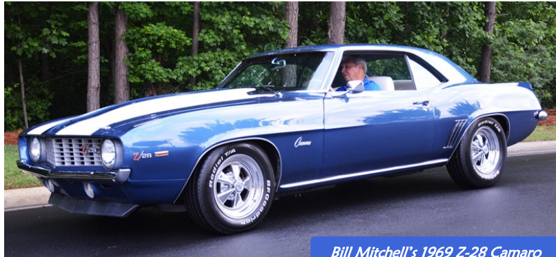
Bill Mitchell's 1969 Z-28 Camaro