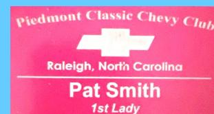
Pink Ladies Name Badge