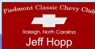
Standard Name Badge