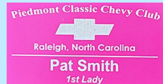
Pink Ladies Name Badge