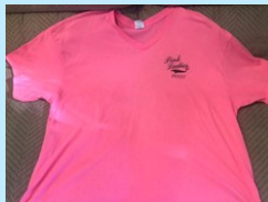
Pink Ladies V-Neck