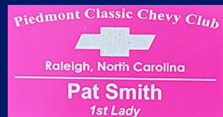
Pink Ladies Name Badge