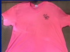
Pink Ladies V-Neck