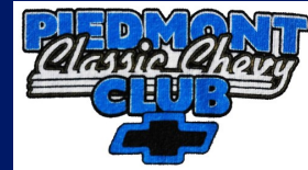
Standard Club T-Shirt with paid dues