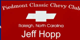
Standard Name Badge